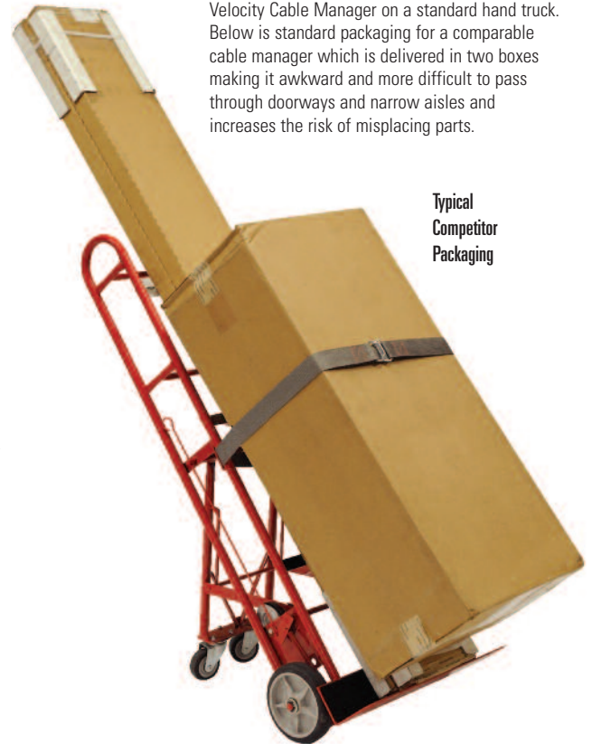
Typical Competitor Packaging

Compact packaging makes it easier to move Velocity through the job site. The photo above is a complete 12 inch wide (305 mm) double-sided Velocity Cable Manager on a standard hand truck. Below is standard packaging for a comparable cable manager which is delivered in two boxes making it awkward and more difficult to pass through doorways and narrow aisles and increases the risk of misplacing parts.