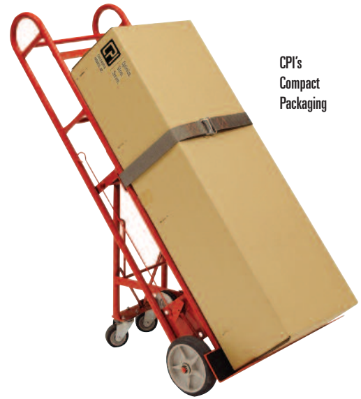
CPI's Compact Packaging

Compact packaging makes it easier to move Velocity through the job site. The photo above is a complete 12 inch wide (305 mm) double-sided Velocity Cable Manager on a standard hand truck. Below is standard packaging for a comparable cable manager which is delivered in two boxes making it awkward and more difficult to pass through doorways and narrow aisles and increases the risk of misplacing parts.