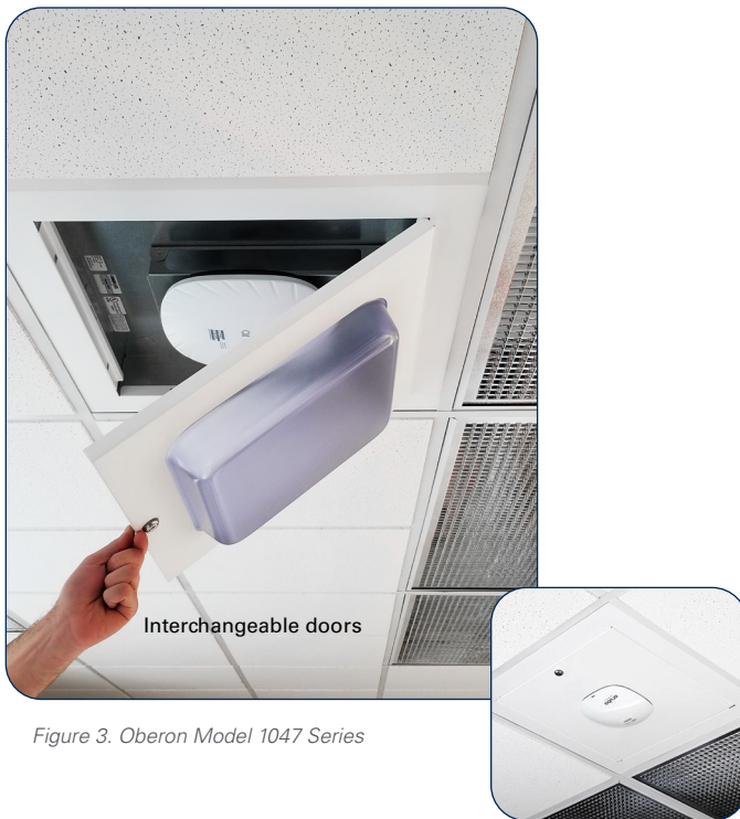
Figure 3. Oberon Model 1047 Series

These examples demonstrate enclosures and mounts with lockable, interchangeable trims and doors that can easily be swapped out are satisfying several operation and functional requirements—such as Oberon’s Wi-Tile™ 1047 Series (Figure 3) locking suspended ceiling tile Wi-Fi AP enclosure with interchangeable doors or Oberon’s H-Plane™ 1007 Series (Figure 4) right-angle AP wall mount, which mimics a lighting wall sconce with an interchangeable trim to allow installers to recess APs from all the leading vendors into the wall sconce itself. AP installation methods should include an adaptable platform, preparing for NextGen networks.