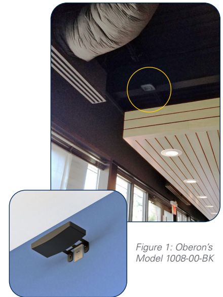
Figure 1: Oberon's Model 1008-00-BK

Additionally, in many historic educational facilities, maintaining aesthetics is crucial. The need to integrate new technology into old buildings is especially common in colleges and universities. These structures were often built hundreds of years before modern technology was adopted. However, it's important to incorporate technology systems into these spaces with the goal of providing robust service while simultaneously preserve the aesthetics as much as possible. This is proven true for new modern building architecture as well. Exposing wireless AP's is undesirable and most often not permitted in architecturally sensitive spaces. This is becoming more common as a result of increased amount of AP's required through out the facility. Therefore, wireless professionals are tasked with hiding them, or otherwise blending them into the surroundings. The key is to not jeopardize performance while doing so. These examples demonstrate spaces in which the AP's were not permitted on the wall, and also not permitted on the modern ceiling design. Oberon's Model 1008-00-BK with Oberon's Black Access Point Cover was the perfect fit for this application. (Figures 1 & 2)