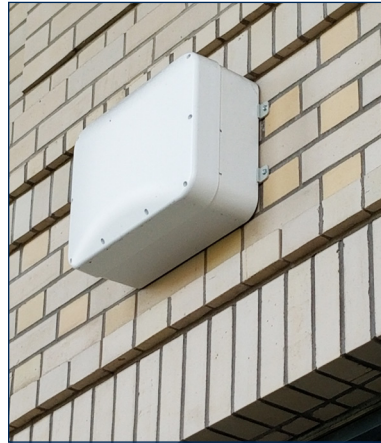
Figure 6. Oberon Model 1022 Series

Meanwhile, Oberon’s NetPoint™ Wireless Bollards (Figure 7 and 8) supports robust wireless coverage while protecting the AP, antenna and connectivity components in green spaces or any other location of need and come in a wide range of colors and heights to blend seamlessly into any outdoor environment.