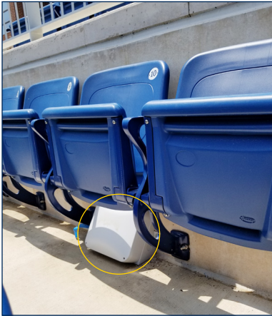
Figure 5. Oberon Model 1020 Series

In these spaces, APs and associated cabling components still need to provide optimal wireless coverage, but must be physically secured, protected from the elements, often times impact-resistant, receptive to wash down, and perhaps above all, aesthetically blended into the environment. For these needs, Oberon offers a wide range of NEMA-rated, UV-resistant enclosures designed with aesthetics in mind, including the Skybar™ 1020 Series (Figure 5,) Skybar™ 1021 Series, and Skybar 1022 Series (Figure 6) which can mounted under seats, on walls and overhangs for maximum space savings and durability.