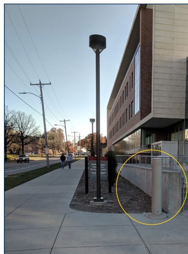
Figure 8. Oberon Model 3032 Series