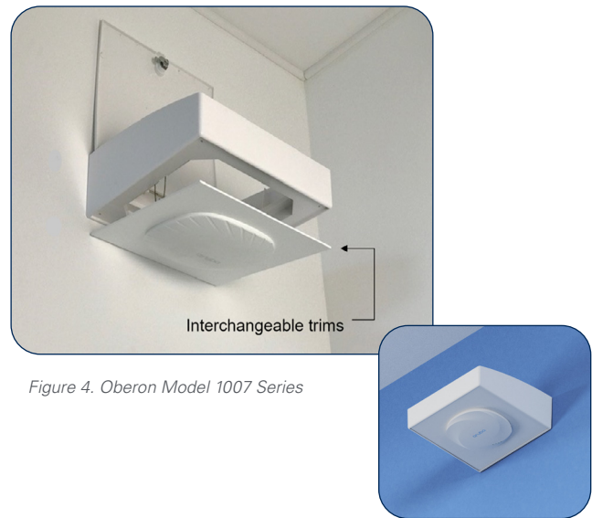
Figure 4. Oberon Model 1007 Series

But what about ensuring network coverage in other indoor spaces (like laboratories or gymnasiums) and outdoors? Beyond the classroom, particularly in higher education and on college campuses, it has become just as important to provide ubiquitous network infrastructure in places like parking garages, outdoor courtyards and common areas, as well as sports venues and stadiums where thousands of people congregate throughout the school year.