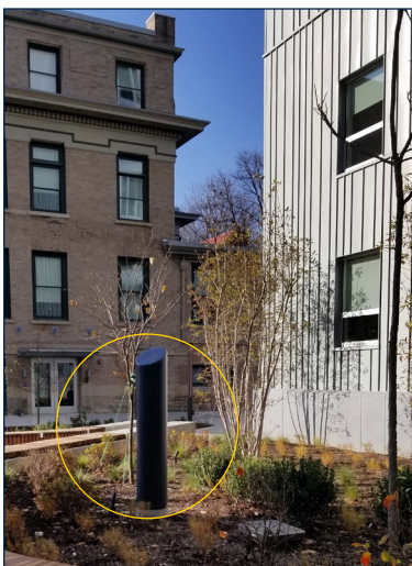
Figure 7. Oberon Model 3032 Series

Meanwhile, Oberon’s NetPoint™ Wireless Bollards (Figure 7 and 8) supports robust wireless coverage while protecting the AP, antenna and connectivity components in green spaces or any other location of need and come in a wide range of colors and heights to blend seamlessly into any outdoor environment.