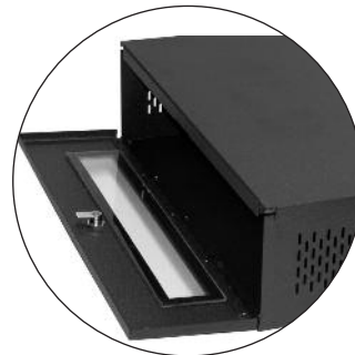
Hinged Front Door