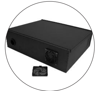
Accessory Fan Kit