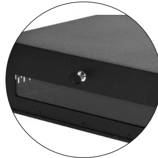
Locking Front Door