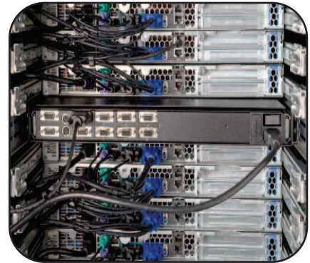
Rear view installation of CenterPoint KVM Switch/Console in a CPI TeraFrame™ Cabinet System

Note: Order one KVM Signal Cable per computer-to-switch connection. Use extension cable and converter if required. Use two KVM Signal Cables (two KVM ports) for 2-user switch-to-switch connections. Contact CPI Technical Support for configuration assistance.