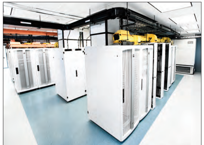
CPI Cabinets and Racks in Orlando Health Data Center

The overall contemporary design greatly contributed to energy efficiency by enabling Orlando Health to reduce their estimated 16 CRAC units to a much