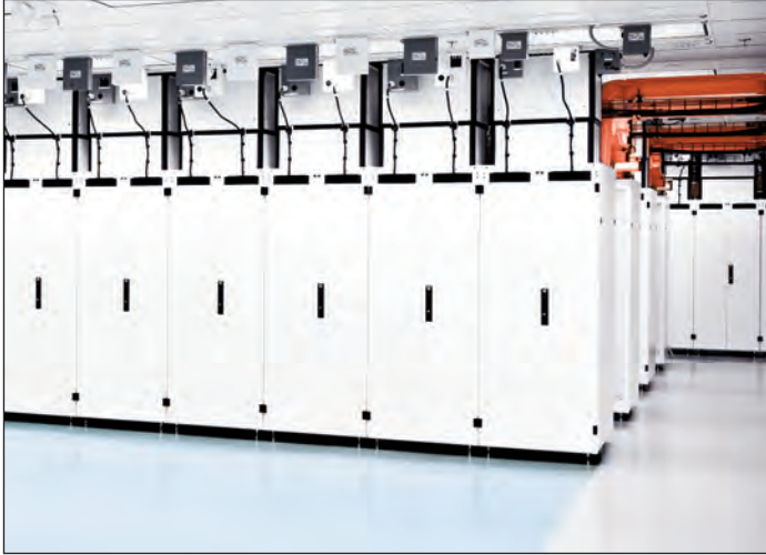
F-Series TeraFrame® Cabinets deploying CPI's Passive Cooling® Solution

“ Healthcare professionals expect systems that are reliable and perform well. An organization must have a robust network infrastructure and a stable computing environment. ”