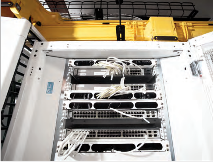
CPI Custom Air Box designed specifically for switches that require side airflow