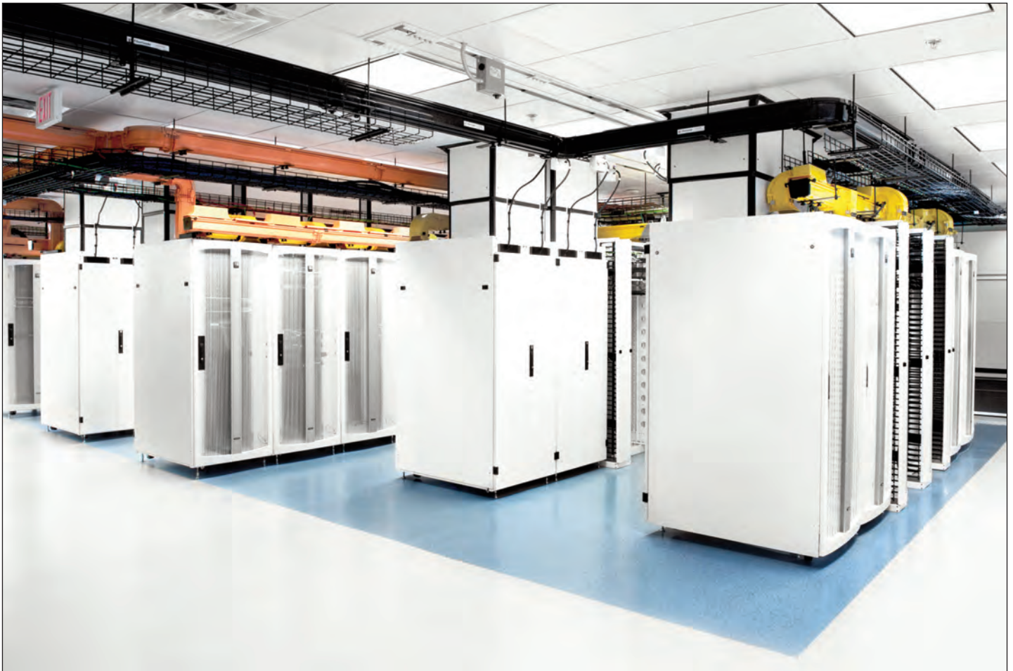
Provide efficiency and an aesthetically pleasing appearance.

To further enhance the contemporary design of this state-of-the-art data center, CPI customized an air box for side breathing switches specifically for Orlando Health. “We did participate in developing an airflow box specifically for the Cisco Catalyst 3750-E Series Switch, which had not previously existed. We were able to provide input into the design considerations for that