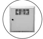
Optional door - Mounted fan keeps equipment cool.