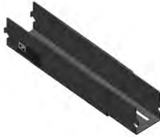
Front-To-Back Cable Manager installed

For assistance in configuring your TeraFrame Cabinet, contact Technical Support at 800-834-4969 or visit CPI's Product Configurator at www.chatsworth.com/configurator .