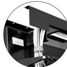
Integrated top jumper trough provides smooth transition

X=color: 7=Black, E=Glacier White. 55100-703 and 55104-701 available in black only.