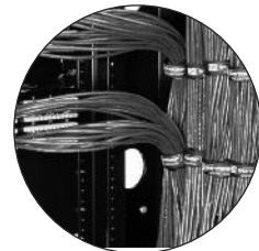
Unique fins support large bundles of cable

800-834-4969 in U.S. & Canada • www.chatsworth.com