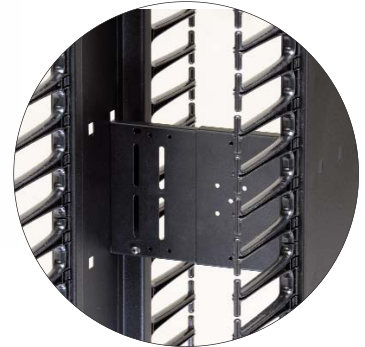
Movable Mid-Section installed on Evolution Cable Manager