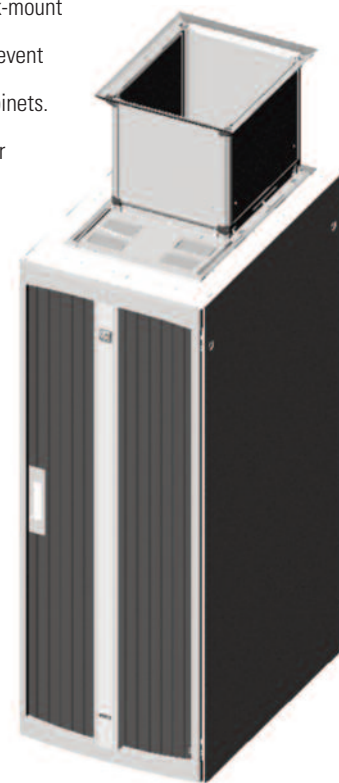
Rendering of a custom CPI TeraFrame® Cabinet with Vertical Exhaust Duct