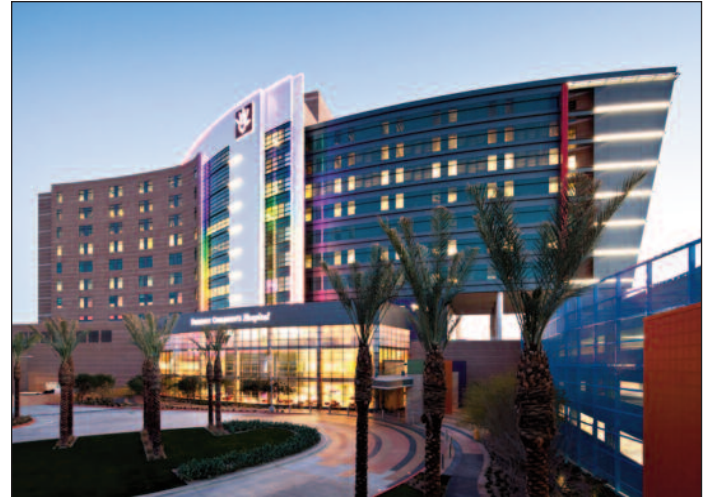
Phoenix Children's Hospital, Photography by Blake Marvin/HKS, Inc.

products and the most energy efficient methods for thermal management, all of which give the hospital's data center an adaptable configuration that will serve it far into the future.