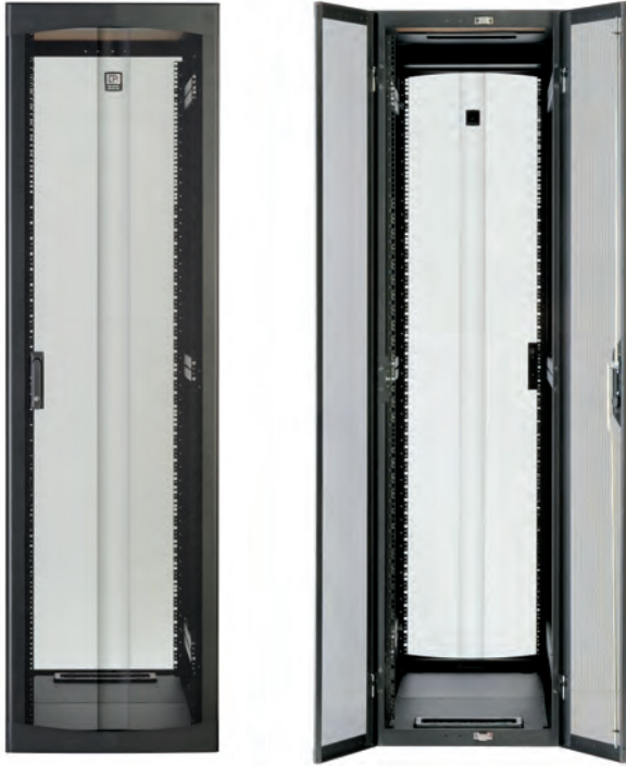
Front and rear view of T-Series SteelFrame Cabinet with Curved Perforated Metal Front Door and Double Perforated Rear Door.

The T-Series SteelFrame Cabinet was designed for applications requiring a fully featured standard solution for mounting and securing electronic, network and security equipment. Now available with CPI Passive Cooling® Solutions, the T-Series SteelFrame Cabinet can be used in any application. This innovative thermal management technique allows you to isolate hot air with the Vertical Exhaust Duct and control airflow through the cabinet space in turn reducing data center energy costs and maximizing cooling unit efficiency. Add our comprehensive range of accessories from shelves and cable management products to power strips and fans for a complete, affordable solution.