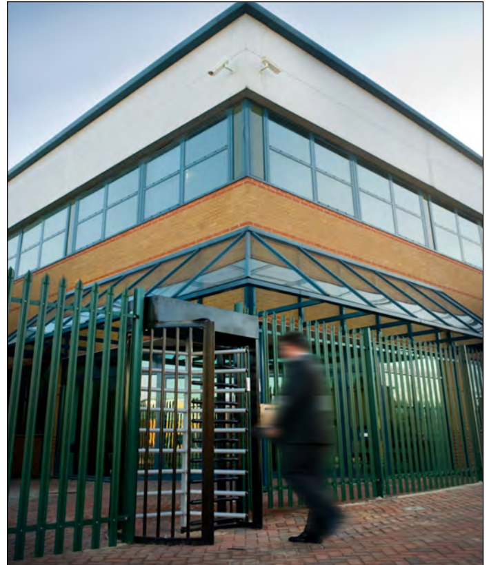
Powergate, TelecityGroup's eighth London data center is at the forefront of data center innovation offering colocation facilities with up to 20kW power per cabinet.

TelecityGroup decided to populate the new Powergate data center with cabinet and thermal management solutions from Chatsworth Products (CPI). These solutions matched TelecityGroup's key business drivers by providing