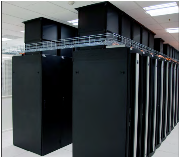
CPI's F-Series TeraFrame® Cabinet System was selected for the 5,000 square metre data center.

To manage high-density equipment while meeting the company's energy efficiency goals, unique airflow management techniques were implemented using CPI Passive Cooling® Solutions. These solutions are designed to reduce operational costs by completely isolating hot exhaust air from cool supply air, maximising cooling unit efficiencies. The passive cooling components installed include Air Dam Kits to block airflow around the top, bottom and sides of equipment, and telescoping Vertical Exhaust Ducts that move equipment exhaust out the top of the cabinet and up into the plenum. "We were able to deploy CPI's cabinet and thermal solutions without any modification to the data center infrastructure, making this a fast, flexible and cost effective decision," declared Oosthoek.