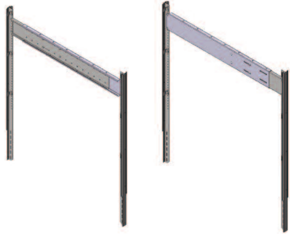
Use one Cabinet Supported Exhaust Duct Horizontal Support Beam (front and back shown) between every other cabinet along the contained aisle to connect the sides of the duct.