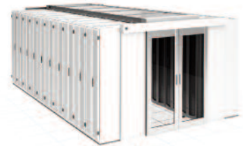
Cabinet Supported Ceiling Panel Kit shown removed (partially disassembled) and installed. Ceiling kit is sold under a single part number and includes all components needed to cover the contained aisle.