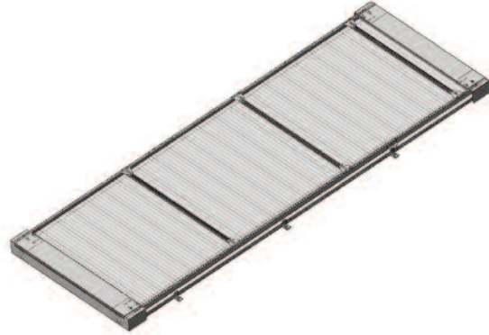
Sold as a single part number. Select to match cabinet row length, each end extends up to 4" (100 mm).