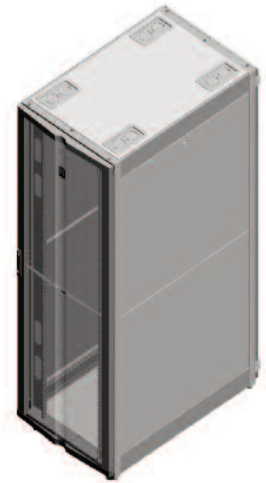
GF-Series GlobalFrame Gen 2 Cabinet