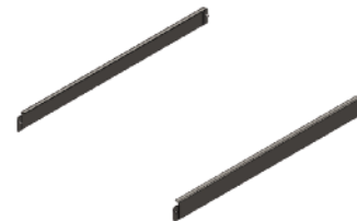
Aisle Containment Cabinet to Floor Side Seal Kit

800-834-4969 in US & Canada • www.chatsworth.com