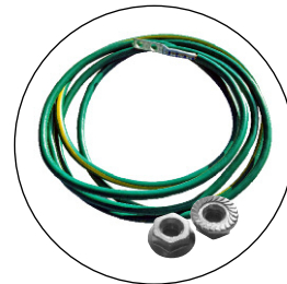
Rack Ground Jumper Kit (Ordered Separately)