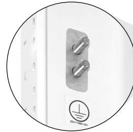
Integrated Ground Studs

Notes: *CPI and Panduit racks are 52U. Pentair-Hoffman and Cooper B-Line Racks are 51U.