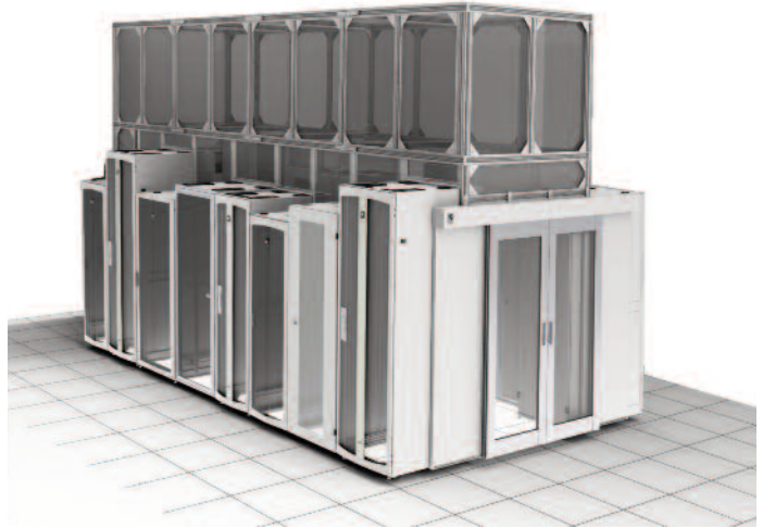
Fully Assembled Built To Spec (HAC) Solution.

This document lists service parts for the Build To Spec Kit Hot Aisle Containment (HAC) Solution including components of the Built To Spec Kit (33000_CUT) and the Full Height Cabinet Blanking Panel (33002_CUT). Service parts include extrusions, brackets, panels and edge seals and are used as replacement parts or to update the solution as cabinets/applications change.