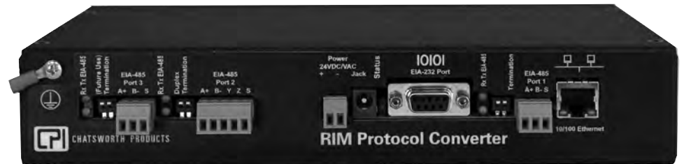
60106-002 RIM Protocol Converter, Dual Port

The Remote Infrastructure Management (RIM) System Protocol Converter from Chatsworth Products (CPI) provides system integration with facility monitoring and management systems. The RIM Protocol Converter converts sensor outputs in SNMP, BACnet and Modbus protocols into one or more of the same protocols for integration into a building management system (BMS) or network management system (NMS). The Protocol Converter is ideal for environments where data from monitored equipment is incompatible with the protocols used by the BMS or NMS, especially in applications that feature legacy monitoring systems.