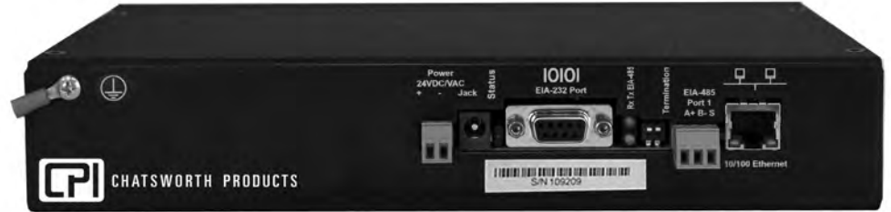
60106-001 RIM Protocol Converter, Single Port