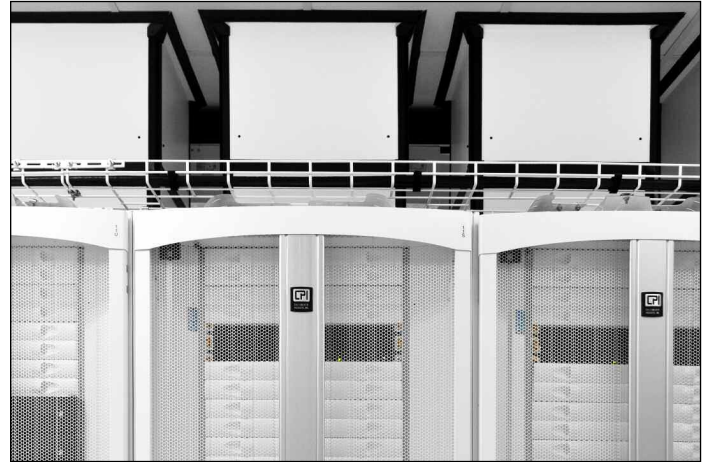
CPI's Vertical Exhaust Ducts guide hot exhaust air from the back of the cabinet to the drop ceiling plenum, creating a closed hot air return path to the cooling system.

Glacier White is not only an aesthetic feature, but the color also provides benefits, such as better visibility in the data center, which can reduce lighting costs and contribute to the energy efficiency UF Health Shands was hoping to achieve.