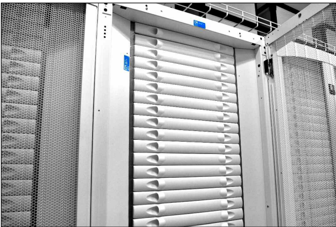
The highly-effective seal on CPI's Snap-In Filler Panels prevent hot air from recirculating between the filler panels.

“Once engineering was complete, we focused on aesthetics,” Kowal stated. “Being a hospital, we wanted the data center to have a clean room feel. Having all white accomplished that extra level of aesthetics that demonstrates we take the cleanliness of our data center seriously,” he added.