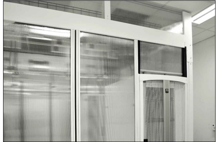
UF Health Shands utilized CPI's custom HAC Solution to maintain cooling, while accommodating storage solutions of various heights, widths and depths.