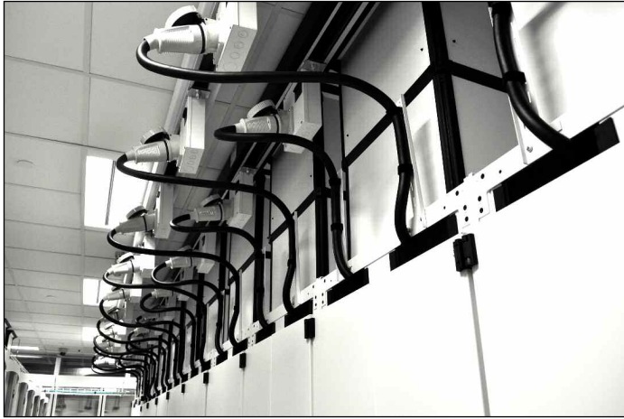
CPI manufactured custom cable openings into the cabinets to fit UF Health Shands’ unique design.

Custom cable openings were also installed on the cabinets to allow proper power application.