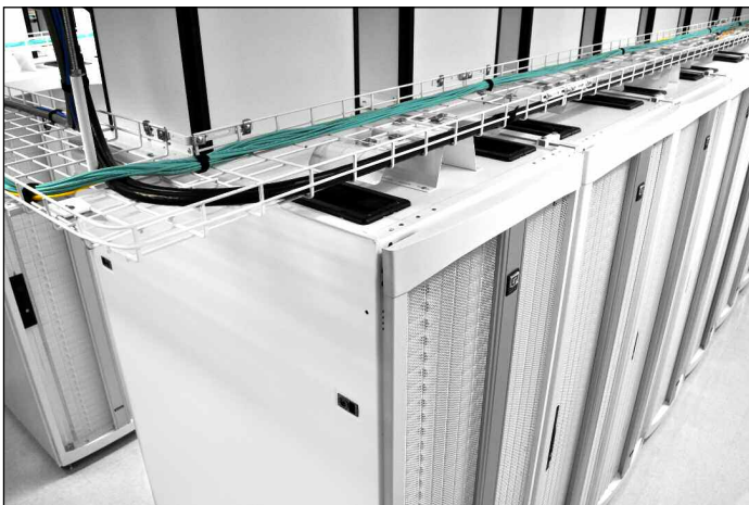
CPI's OnTrac Wire Mesh Cable Tray provides point-to-point pathways for the network cabling in the data center.

By June 2013, UF Health Shands Hospital had begun planning the new data center, complete with CPI products.