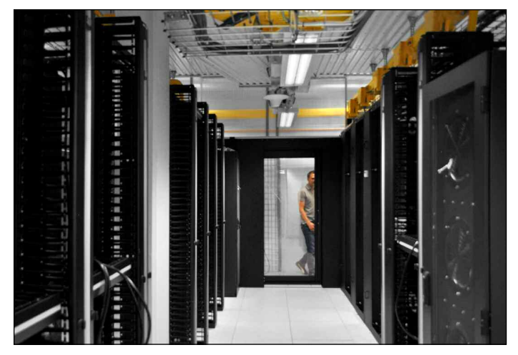
Open Architecture design supports Hot Aisle Containment and allows for more equipment.

SpareBank 1 received five different tenders from data center solution companies. Negotiating with the top three parties, SpareBank 1 found Coromatic AS to be best suited for their needs. Coromatic had a solid history of quality solutions, skills and experience with projects whose demands would be similar to their own and in May of 2013, SpareBank 1 signed an agreement with the vendor. Construction then began in the summer of 2013.