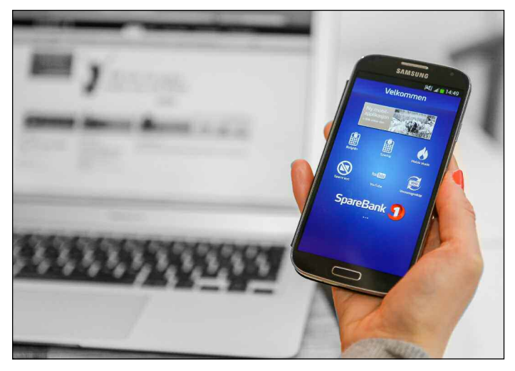
SpareBank 1's 1.9 million customers rely on this data center to support online banking and insurance systems.