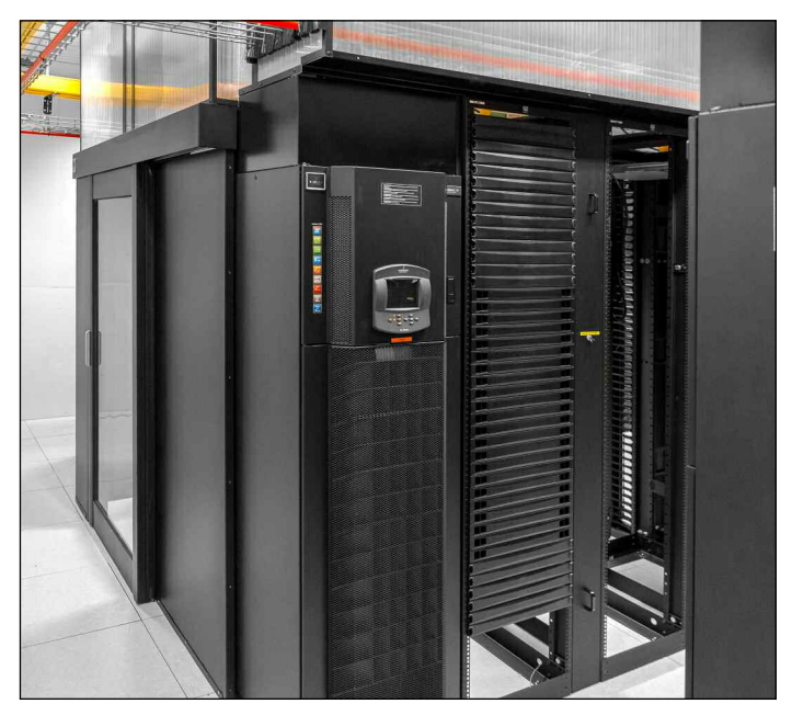
Evolution® Cable Management, Four-Post QuadraRacks, Aisle Containment Door Systems and Brushed Grommets were used to build a flexible solution that could be assembled on site.

Coromatic teamed up with data center product manufacturer Chatsworth Products (CPI), and together the two companies faced the challenge of designing and constructing a large data center in a challenging environment. The team approached the project using an open architecture design to create a layout that would support Hot Aisle Containment while saving space. Once they determined that the infrastructure would fit into the area provided, they then faced planning a project where assembly was challenging because of space limitations. Coromatic and CPI determined that due to these limitations, a pre-configured system was not an option and that the data center would