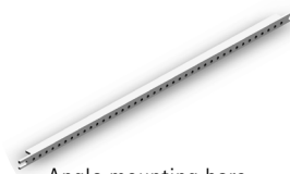
Angle mounting bars Sold separately