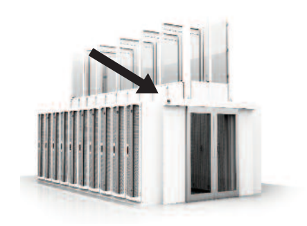
Adjustable Height Filler Panels (20 shown) attached to the Frame-Supported Exhaust Duct. Panels are used above each cabinet to fill the gap between the cabinet and the 52U high frame/duct.