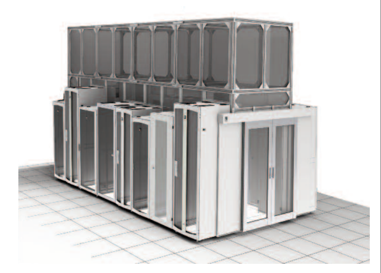
Fully Assembled Built To Spec (HAC) Solution.

This document lists service parts for the Build To Spec Kit Hot Aisle Containment (HAC) Solution including components of the Built To Spec Kit (33000_CUT) and the Full Height Cabinet Blanking Panel (33002_CUT). Service parts include extrusions, brackets, panels and edge seals and are used as replacement parts or to update the solution as cabinets/applications change.