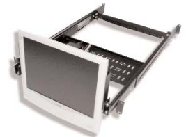
The new LCD Monitor Shelf is sold separately