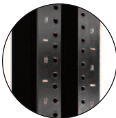
Rack-Mount Unit (U) marks simplify equipment installation

CPI offers EIA aluminum channel uprights on all Standard and Universal racks. All Standard and Universal racks are threaded to accept industry standard #12-24 mounting screws. Extra care is taken in that the threads are "rolled" rather than "cut" for greater strength and durability. The Universal Rack hole pattern is 5/8"-5/8"-1/2" (15.9 mm-15.9 mm-12.7 mm) and is compatible with wide 1 1/4"-1/2" (31.8 mm-12.7 mm) patterns, while offering greater flexibility.