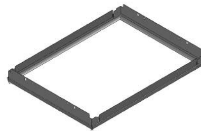
F-Series TeraFrame Gen 2 Cabinet To Floor Seal Kits

Note: Order Front and Side Seal Kits separately to match cabinet size. For Side Seal Kits, cabinet frame depth is the depth at the base of the cabinet frame (side panels are slightly deeper). Overall cabinet depth (door to door) is approximately 3.8" (97 mm) deeper.