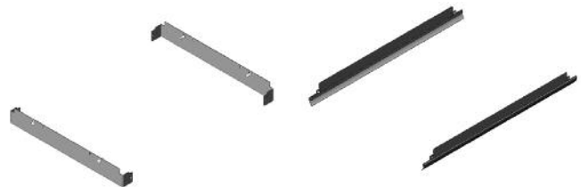
Front Seal Kit