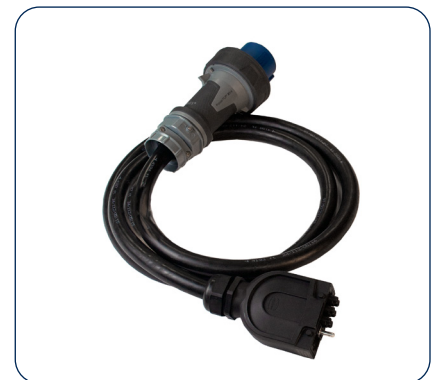
eConnect® Universal Input line cord Cable length: 8 ft (2.4 m)