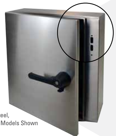
Stainless Steel, Disconnect Models Shown