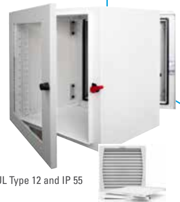
UL Type 12 and IP 55