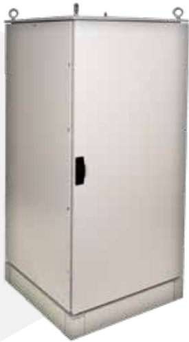
UL Type 12 and IP 55

RMR Industrial Enclosures are engineered to protect equipment with cutting-edge sealing technology, certified ingress protection ratings and multiple equipment mounting options to support IT equipment, automation electronics and electrical controls and instrumentation in any location.