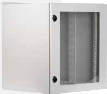
UL Type 12 and IP 55