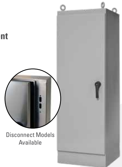
Disconnect Models Available