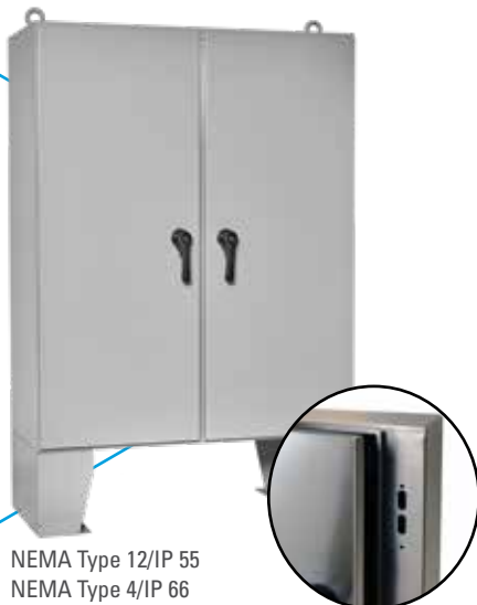
NEMA Type 12/IP 55 NEMA Type 4/IP 66