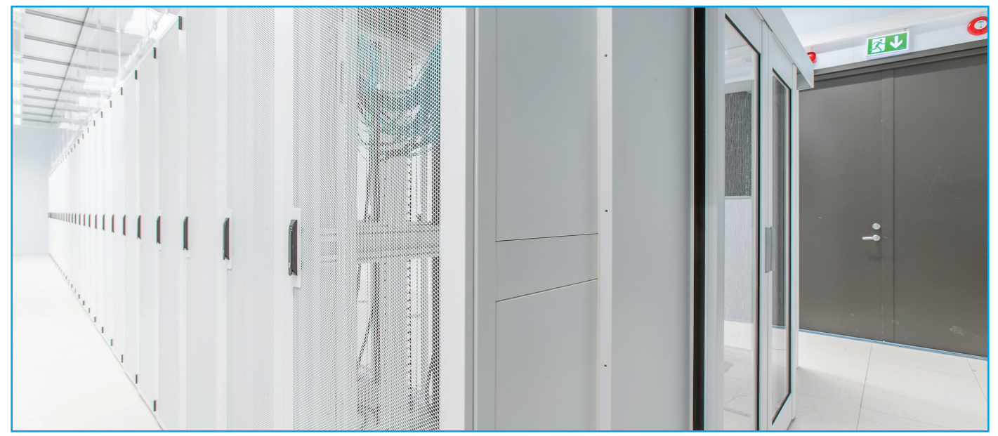
CPI's BTS Kit effectively isolates hot exhaust air and directs it back to the air-to-air cooling system, increasing cooling efficiency.

This innovative cooling technology demanded a containment strategy that could effectively manage the separation of hot and cold airflow. The solution needed to be of the highest quality, easy to work with and flexible enough to accommodate a mix of cabinets and equipment from multiple suppliers.