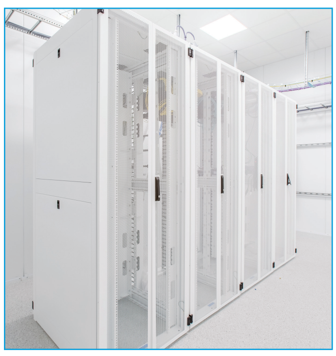
The GlobalFrame Cabinet provides reliable equipment support, superior cable organisation and smart airflow management.

Taking a team approach was the key to building the trust needed for Basefarm and CPI to work together to successfully design and build Oslo's biggest and greenest data centre yet–Basefarm Oslo 5.