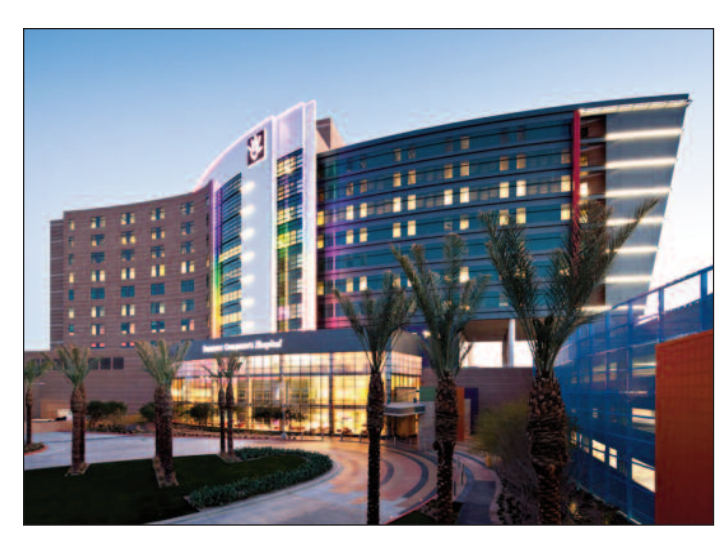
Phoenix Children's Hospital

Kitchell and Sparling chose Chatsworth Products, Inc. (CPI) to collaborate on product specifications and customization. CPI offers premium, customized