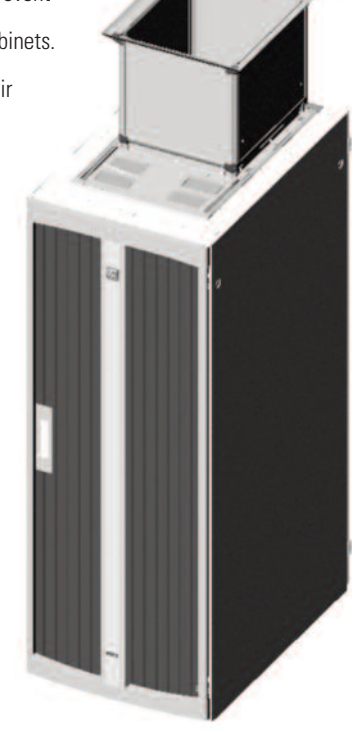
Rendering of a custom CPI TeraFrame® Cabinet with Vertical Exhaust Duct