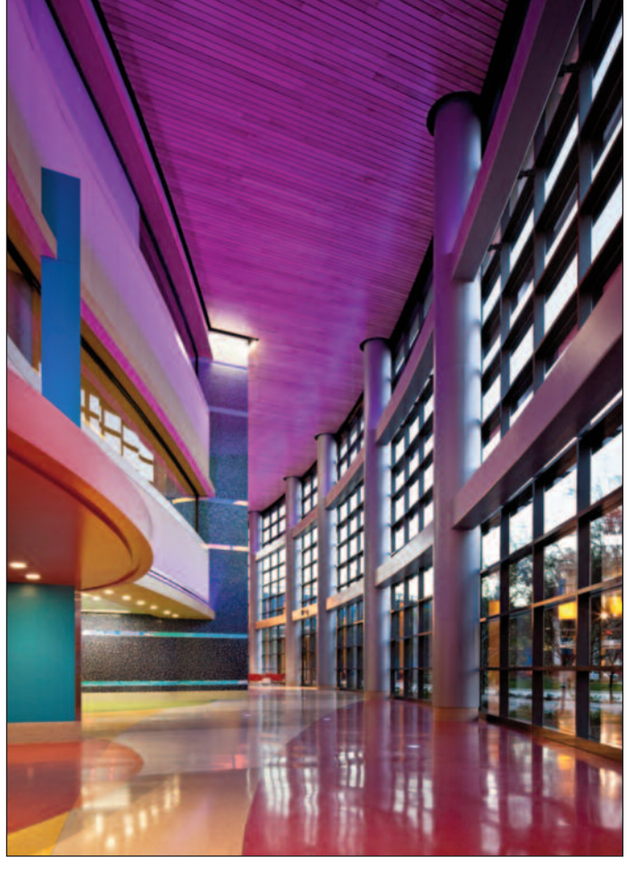
Phoenix Children's Hospital Lobby, Photography by Blake Marvin/HKS, Inc.

increase their database to store valuable, life-saving information with increased capabilities to maintain patient safety and confidentiality.