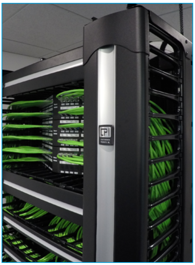
CPI Evolution® Vertical and Horizontal cable managers are a reliable solution for high-density cabling. SCCS has the IT infrastructure support it needs to continue growing its business..

When SCCS was ready to scale the business, Mann knew exactly who to contact.