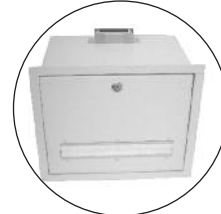
AAT-CAP-UNI-KIT Enclosure with Universal faceplate

Ceiling-mounted wireless enclosures create an architectural space outside of the telecommunication room to store a wireless access point and the wireless connection to the network. Wireless access points are the radio transceivers used to create a wireless LAN within a commercial building.