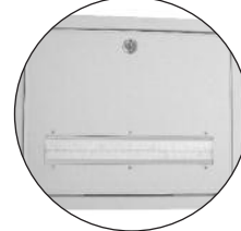
AAT-CAP-UNI Universal faceplate