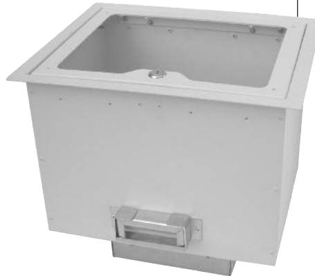
Wireless Access Point Enclosure