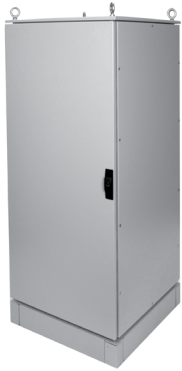
Shown in painted Hammer Gray RAL7035 finish.