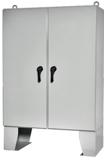
Shown in painted Gray ANSI 61 finish.