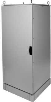
Shown in painted Hammer Gray RAL7035 finish.