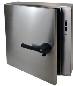
Shown in stainless steel finish.