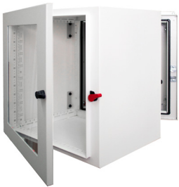
Shown in painted Glacier White finish.