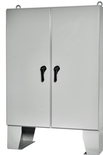
Shown in painted Gray ANSI 61 finish.