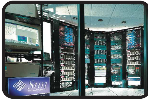
OPEN MOUNTING SOLUTIONS