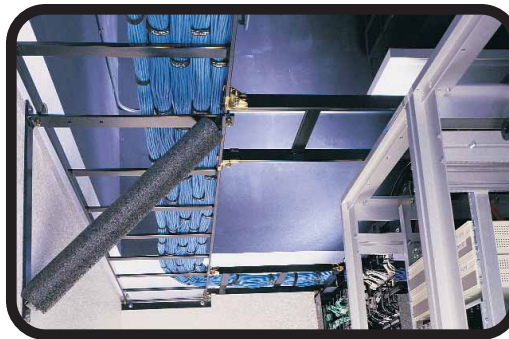
CABLE PATHWAY SUPPORT SOLUTIONS