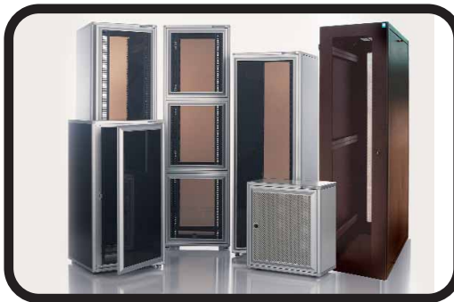
ENCLOSED MOUNTING SOLUTIONS