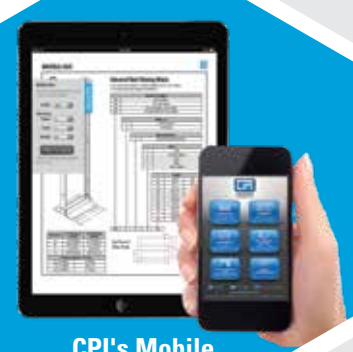
CPI's Mobile Apps